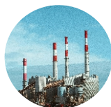
Thermal Power Plants