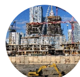
Building and Construction Projects