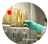
Synthetic Organic Chemical Industry