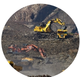
Mining of Minerals including Opencast /Underground Mining