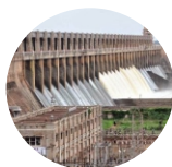
River Valley Projects