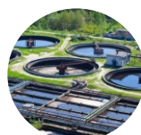
Common Effluent Treatment Plants (CETPs)